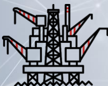
Oil & Gas